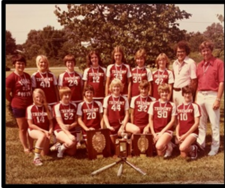
1976 Girls' Softball Team